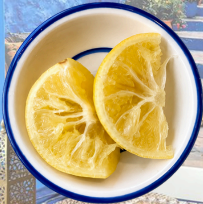
PRESERV ED LEMON